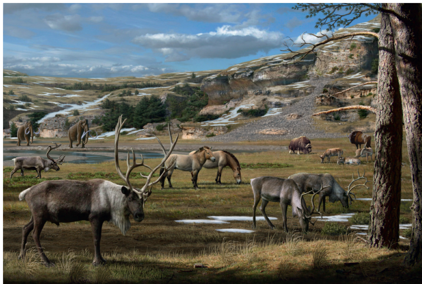
Figure 2. Pleistocene rewilding.

Proponents of rewilding insist that any attempt at rewilding will be preceded by careful study of the potential consequences of the introduction. However, “carefully considered” and “well thought out” introductions of herbivores and predators can produce major unintended consequences. Indeed, advocates of rewilding should not assume ecologists and conservation biologists know more than we do about how dynamic, ever-evolving, idiosyncratic ecological systems once functioned, and they surely should not assume that we can predict the consequences of adding novel species. Likewise, when we predict resulting ecosystem impacts of rewilding, in reality we know little about the effects of natural or introduced diseases and pathogens when animals are introduced and how outbreaks can afflict introduced and native faunas. For example, after the species went extinct ca. 10,000 years ago, seven Eurasian bison were introduced in 2012 to a Danish forest without proper medical and deworming treatment. After the introduction three individuals died of liver parasites in 2015. Other surveys showed that the introduced bison had a rich worm fauna — a well-known health issue for bison — resembling that of the Bialowieza forest of Poland, the origin of the translocated animals [23].